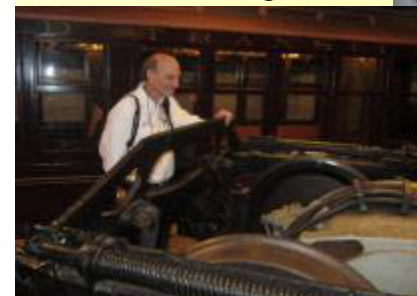
(above) Checking out a 100-year-old truck (left) >>>>