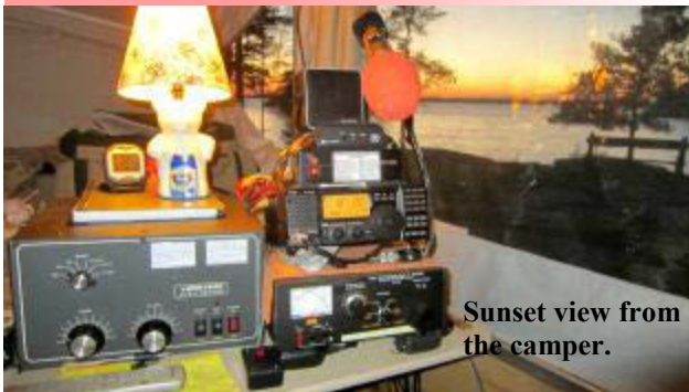
Sunset view from the camper.

Here are a few photos to show everyone how I set up and do the 7.272 Ragchew and the 1721-160m net at the campsite.