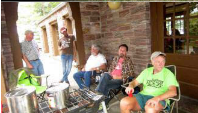
A watched pot... is delicious!