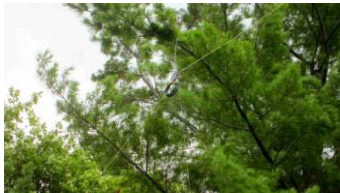
Mounting a simple 40 meter dipole between the trees and a 235 foot long wire for 160 meters made for great signal reports all around.