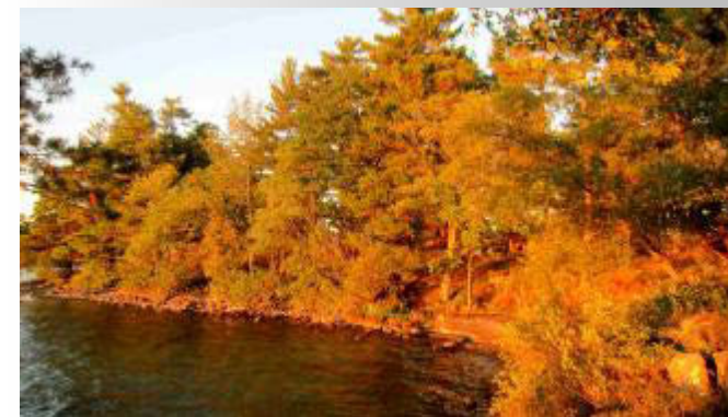
Beautiful sunrises and glorious sunsets along with magnificent days to visit all the attractions the Thousand Islands offer.