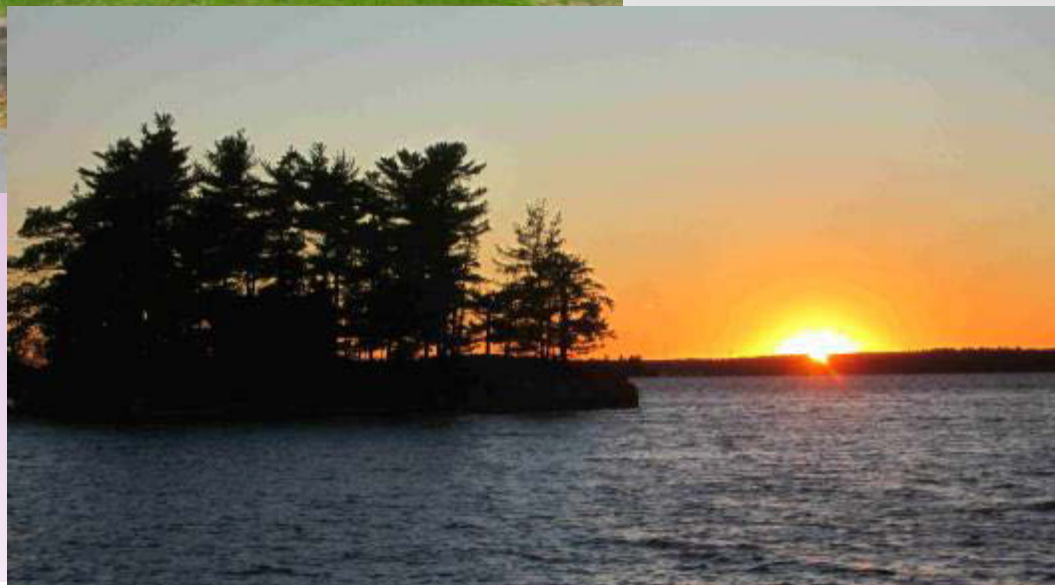
Maybe we'll see you there in 2017.