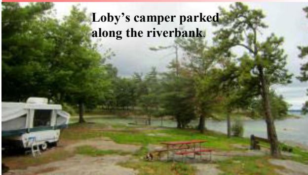
Loby's camper parked along the riverbank.

Here are a few photos to show everyone how I set up and do the 7.272 Ragchew and the 1721-160m net at the campsite.