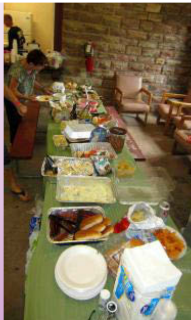
A table full of food shows how blessed we truly are. Good Food, Great Friends.